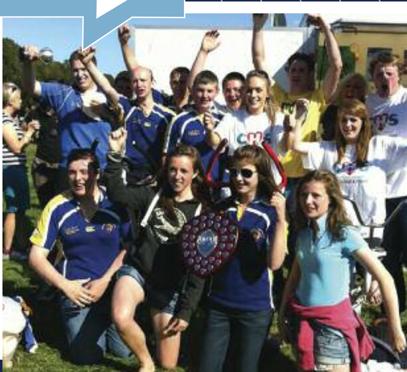
Moycraig YFC members picking up the shield after being named County Superclub.