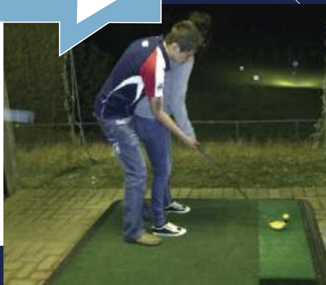
Members taking part in the visit to the driving range.

Senior members of the club scrubbed up well and attended the Co Tyrone Dinner, in the Silver Birch Hotel. An enjoyable night was had by all, and Newtownstewart YFC was successful in obtaining many prizes, including coming 2nd in the Super Club section. Well done to everyone involved!