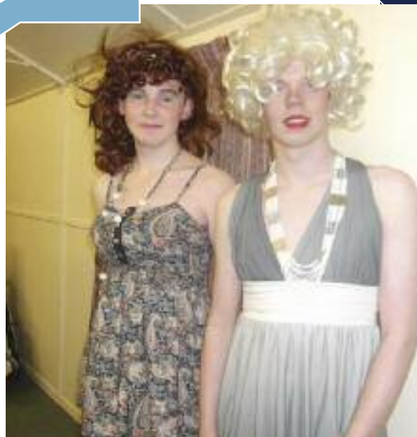
The boys from Curragh getting ready for their performance.

The response from the Rector and the audience was very positive and Curragh YFC has been invited to perform at the opening of the new Church Hall.