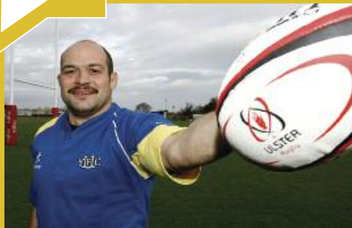
New YFCU patron Rory Best

"We are honoured to announce that Rory Best is our new patron. His knowledge and interest in farming and rural matters, dedication to his sport and enthusiasm for life complements the ethos of our Association and we believe the 2,600 members of YFCU will be able to identify with him and we look forward to working with him."