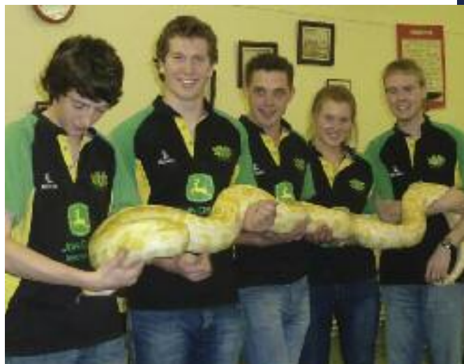
Hillhall YFC members at the reptile night.